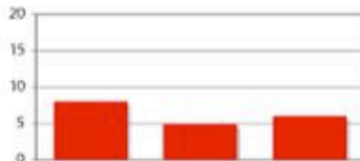
Number of Single Family Homes Sold