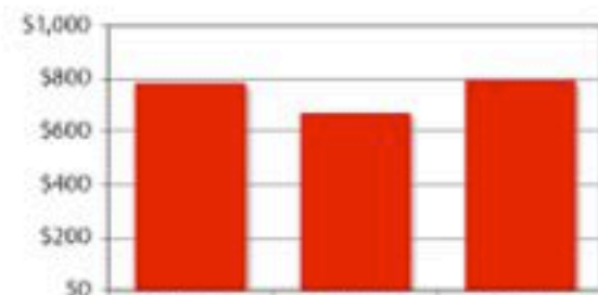
Average Single Family Home Price / Sq Ft