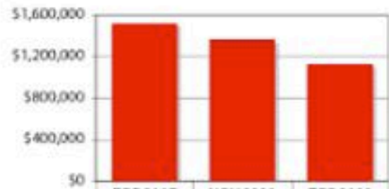
Average Single Family Home Sale Price