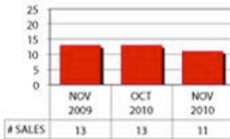
Number of Single Family Homes Sold