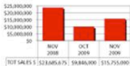
Total Single Family Home Sales Volume