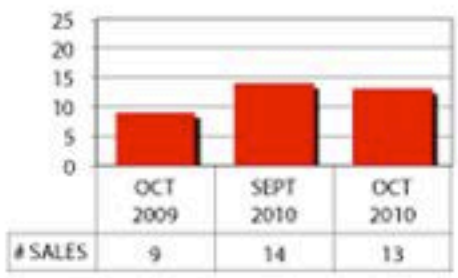
Number of Single Family Homes Sold