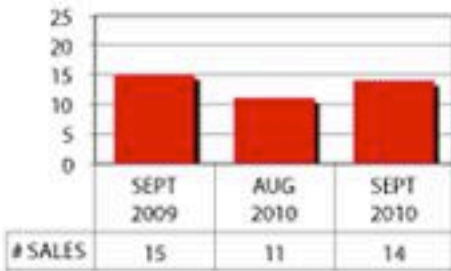
Number of Single Family Homes Sold