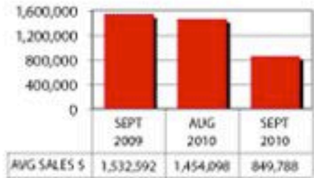
Average Single Family Home Sale Price