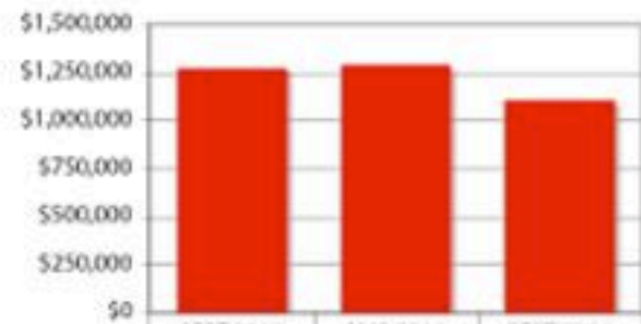
Average Single Family Home Sale Price