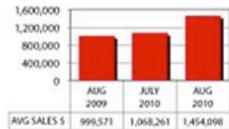
Average Single Family Home Sale Price