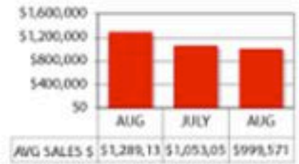
Average Single Family Home Sale Price