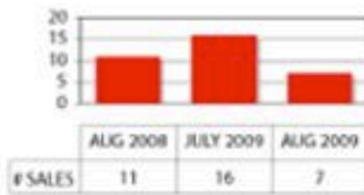
Number of Single Family Homes Sold