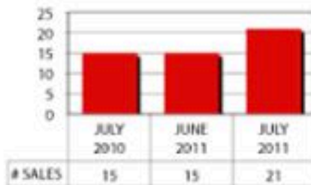
Number of Single Family Homes Sold