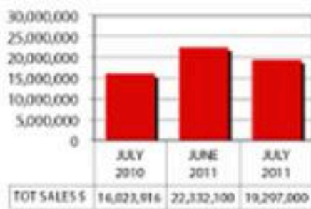
Total Single Family Home Sales Volume