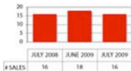
Number of Single Family Homes Sold