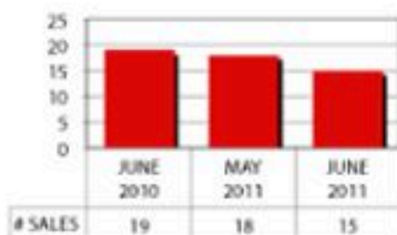
Number of Single Family Homes Sold