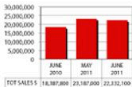
Total Single Family Home Sales Volume