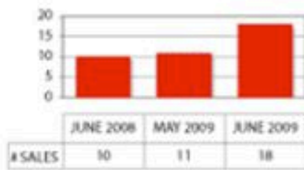
Number of Single Family Homes Sold