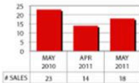
Number of Single Family Homes Sold