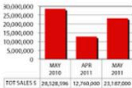
Total Single Family Home Sales Volume