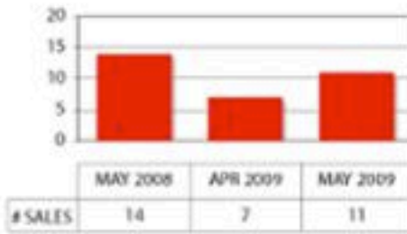
Number of Single Family Homes Sold