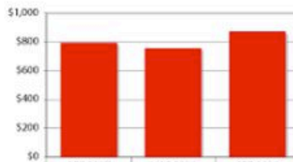
Average Single Family Home Price / Sq Ft