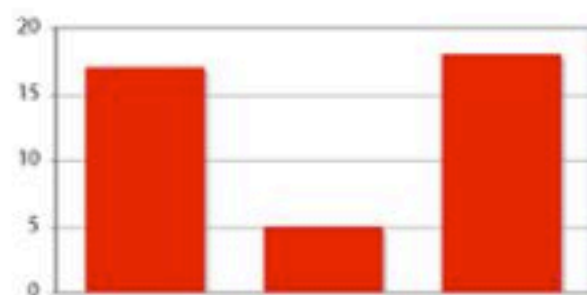
Number of Single Family Homes Sold