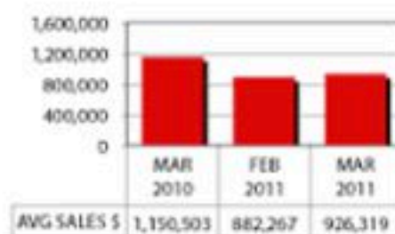
Average Single Family Home Sale Price