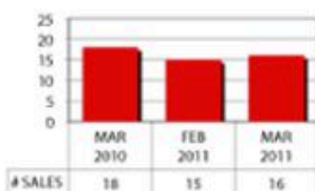
Number of Single Family Homes Sold