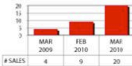
Number of Single Family Homes Sold