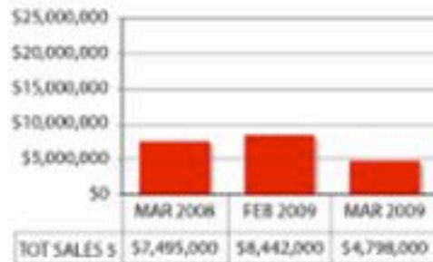
Total Single Family Home Sales Volume