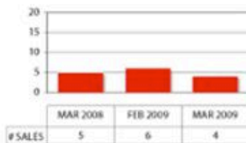
Number of Single Family Homes Sold