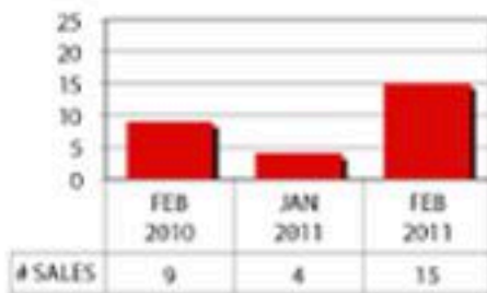
Number of Single Family Homes Sold