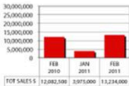
Total Single Family Home Sales Volume