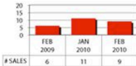
Number of Single Family Homes Sold