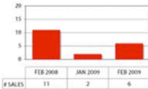
Number of Single Family Homes Sold