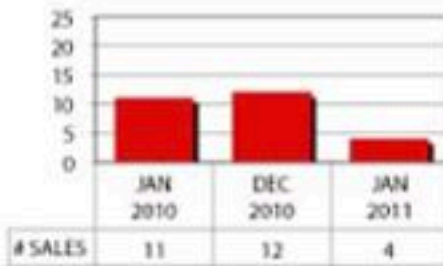
Number of Single Family Homes Sold