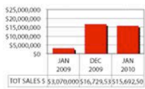
Total Single Family Home Sales Volume