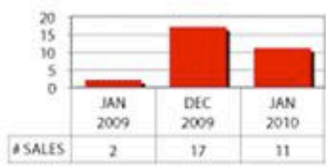
Number of Single Family Homes Sold